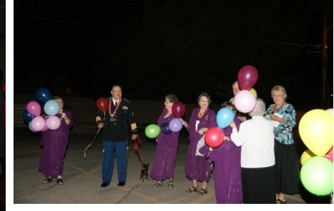
Releasing Memorial balloons