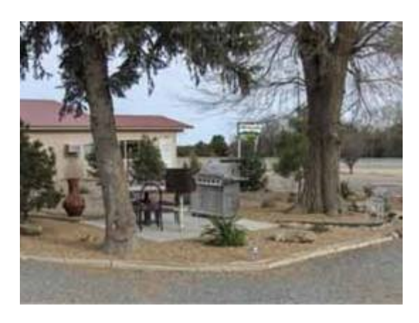
Turner Inn,& RV Park, 303 US HWY 60

If you are not into camping, or your tent has a hole in it, an alternative, to be able to attend and participate in the activities, is to stay in Mountainair. The Turner Inn & RV Park has rooms available starting at $60.00 per night. Their phone number is (505) 847-0248.